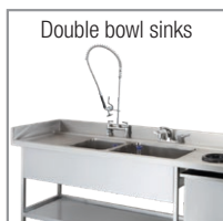
Double bowl sinks