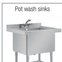
Pot wash sinks