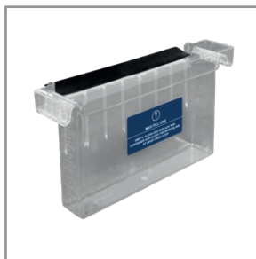
PROTRAP AUTO 1850 FOG TANK