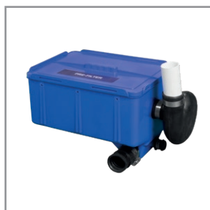
PROTRAP AUTO PREFILTER BASKET (FULL KIT)