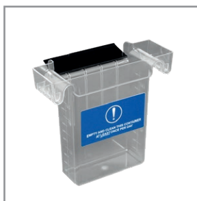
PROTRAP AUTO 1000 FOG TANK