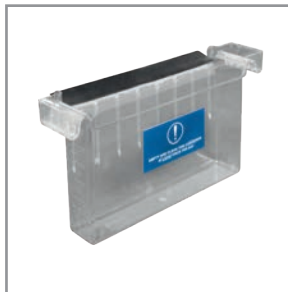
PROTRAP AUTO 1850 FOG TANK