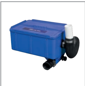
PROTRAP AUTO PREFILTER BASKET (FULL KIT)