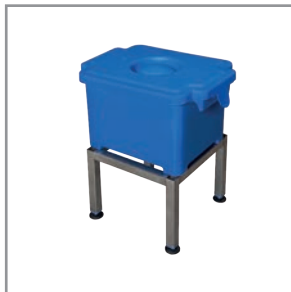
SEPARATOR PRO STANDARD WITH STAND & COFFEE BASKET