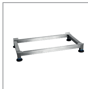
PROTRAP AUTO 1000 STAND